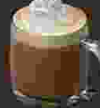
Salted Caramel Mocha

Steamed chocolate milk, espresso & premium vanilla.