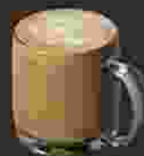
Chocolate Mac Breve

Mocha of caramel and hazelnut, steamed chocolate and dark espresso.