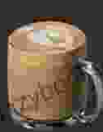
Irish Cream Breve

Rich mochas with caramel sauce and dark roast espresso.