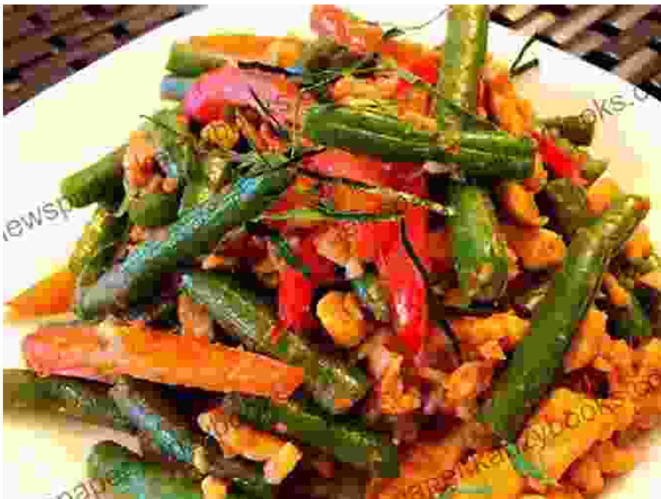
Pad Prik King (Stir-Fried Pork with Green Chilies)

Thai cuisine is not for the faint of heart. Many dishes embrace the bold and spicy flavors of chili peppers, garlic, and ginger, creating a tantalizing dance of heat and savoriness. From the fiery Pad Prik King, a stir-fried dish featuring pork or beef with green chilies, to the palate-awakening Green Curry, a rich and aromatic curry with bamboo shoots and basil, these spicy dishes will set your taste buds ablaze.