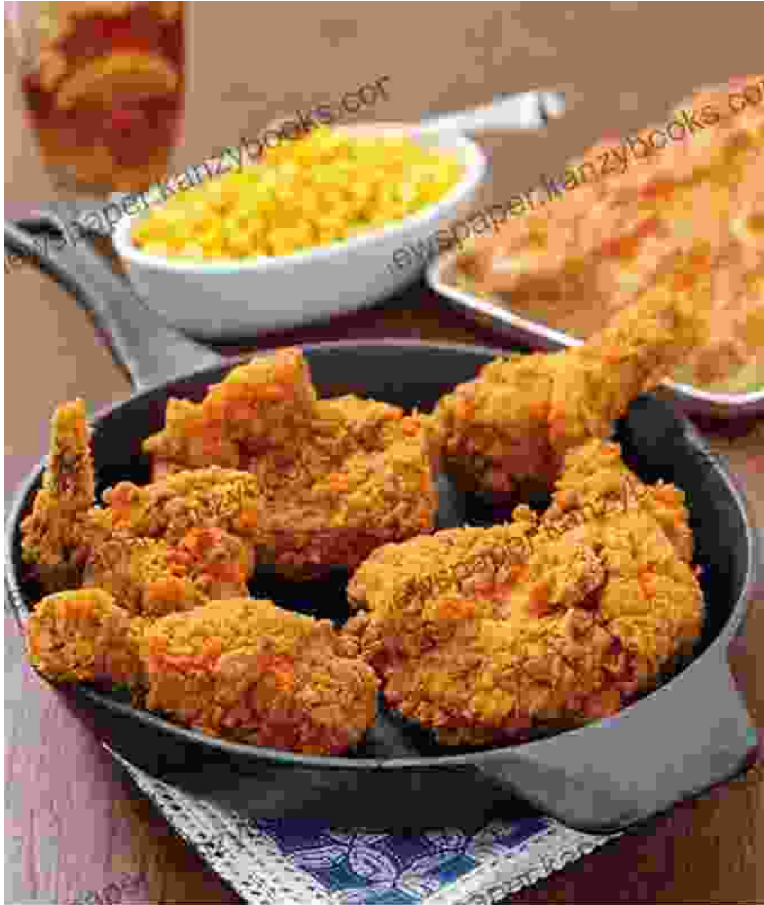
Classic Southern fried chicken with a Memphis twist