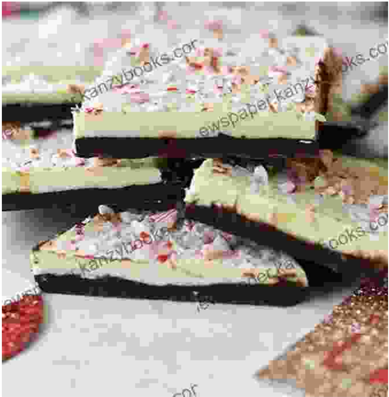
Chocolate-Peppermint Bark: A festive and refreshing treat, our chocolate-peppermint bark combines the rich flavors of chocolate and the cool, minty taste of peppermint.